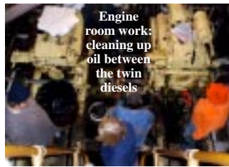
Engine room work: cleaning up oil between the twin diesels